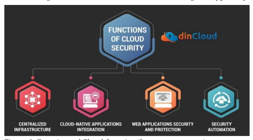
Figure 3: Functions of Cloud Security

Affiliation bases on approaches for threat balance, divulgence, and help. With SMB and endeavors, viewpoints like threat Intel can help with following and zeroing in on dangers to keep central systems checked watchfully. In any case, even individual cloud clients could benefit with concerning safe customer direct plans and masterminding. These generally apply in convincing conditions, regardless controls for safe use and response to dangers can be important to any customer. Explicit structures for ensuring dependable exercises can help. Advancements for testing the validness of fortifications and clear master recovery rules are corresponding as basic for a careful BP plan. Certifiable consistency twirls around getting customer assertion as set by complete bodies. Governments have taken up the meaning of protecting private customer information from being mishandled for advantage. Subsequently, affiliations ought to hold fast to rules to keep these procedures. One technique is the use of data covering, which hazes character inside data through encryption systems.