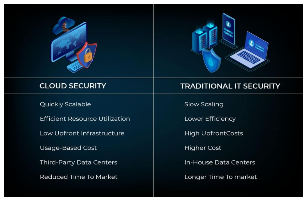
Figure 2: Cloud Security vs Traditional Security