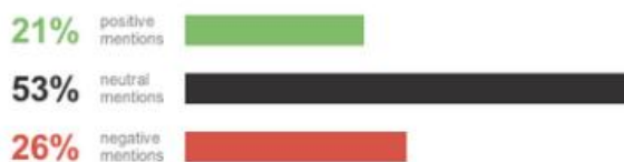
Figure 2: Improving Sentiments

Know and understand your audience: We've adequately said that looking at social media assessment can help you with understanding your group. Notwithstanding, it works the two distinct ways: Understanding your group enables you to achieve (and keep up) an optimistic social viewpoint. Right when you know your customers well, you can make distributions that interconnect with them. In a general sense, it boils down to this: Give your customers or crowd a more superior level of what they need. Channel your energy and assets on your customers' necessities and needs. When you comprehend the sort of fulfillment that they look for and you deliberately and genuinely put forth attempts towards accomplishing them while not leaving them out of the loop, you will generally produce good slants in any event when everything is on the line.